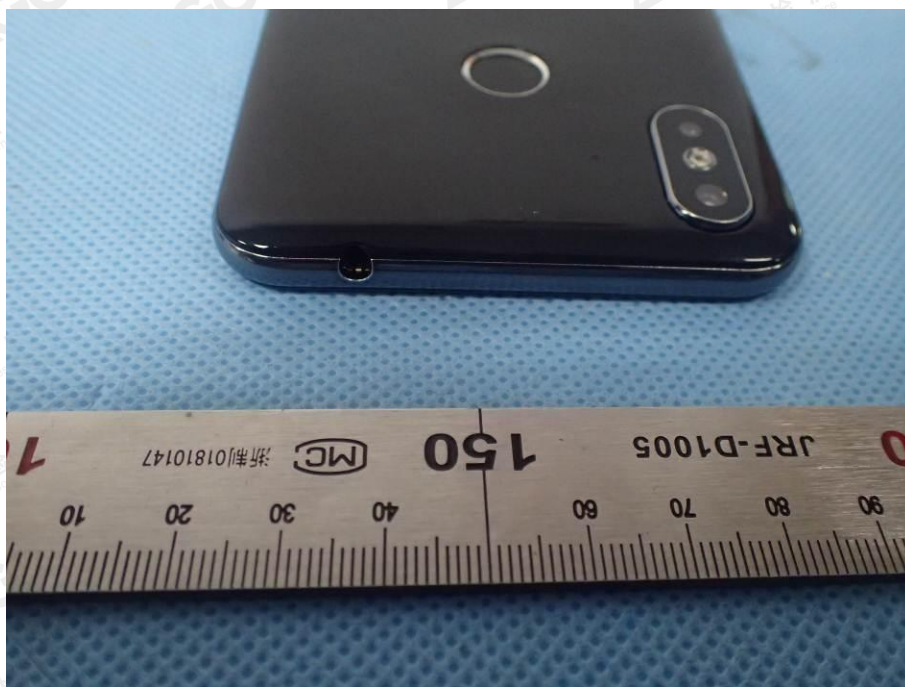
Fig.3 – view of earphone jack