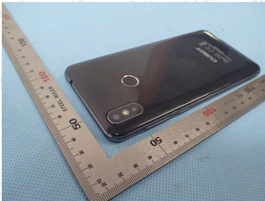
Fig.2 – overview

The results shown in this test report refer only to the sample(s) tested unless otherwise stated and the sample(s) are retained for 30 days only. The document is issued by AGC, this document cannot be reproduced except in full with our prior written permission. The more details and the authenticity of the report will be confirmed at http://www.agc-cert.com .